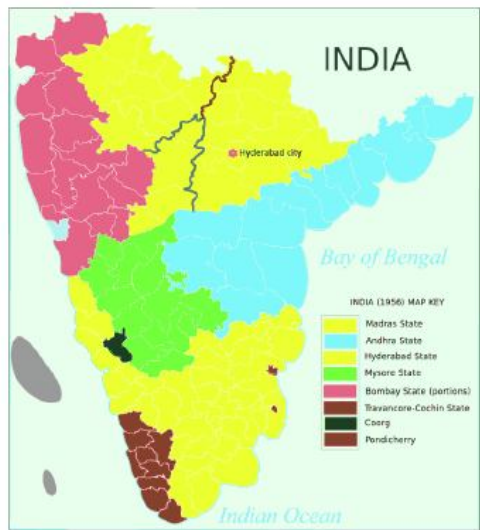
Map 1 : A graphic representation of various regions in the southern peninsula before State reorganisation.

5. Observe the map and answer the following questions: