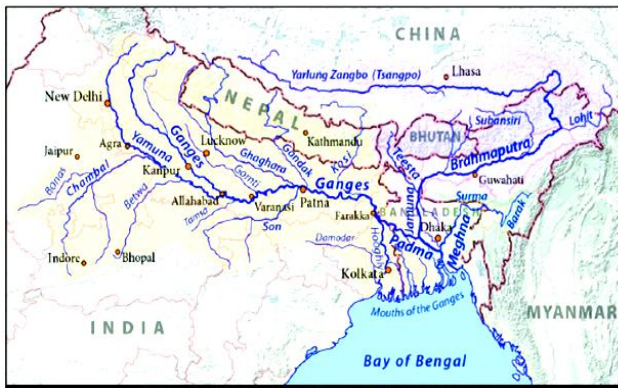
Map 2 : Ganga joining with Brahmaputra